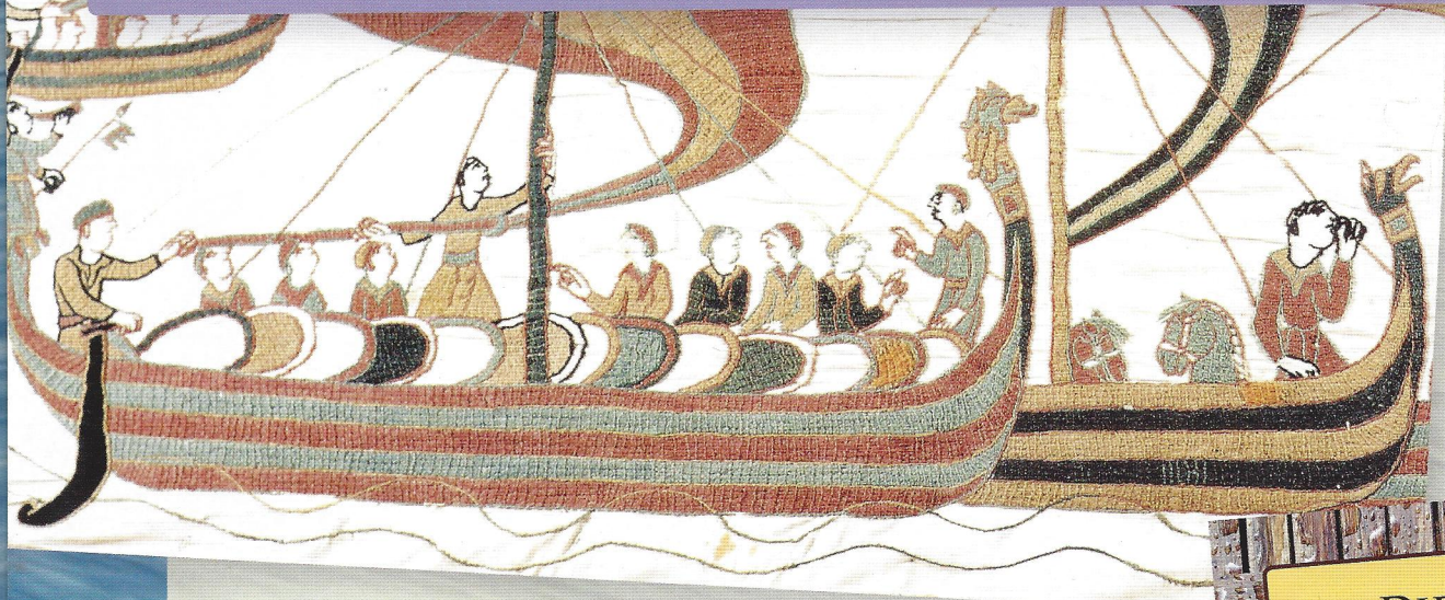
This detail from the Bayeux Tapestry shows Norman warriors sailing their warships to invade England.

V ikings used the threat of raids to demand money from other nations. These payments were called 'Danegeld' (say dane-geld). If foreign kings refused to pay, Viking raiders attacked their lands. Each Viking king or jarl recruited local farmers to fight for him in his own private army called a lid (say lith). He expected them to be fiercely loyal to him, and to each other. In return, he rewarded them with treasures, and protected them from rival armies.